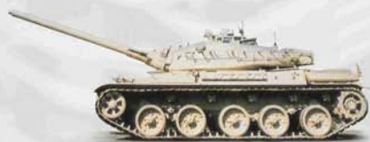
MBT AMX 30